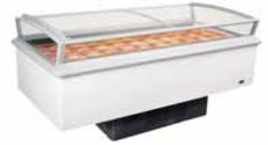
Multinor 2060/80 G