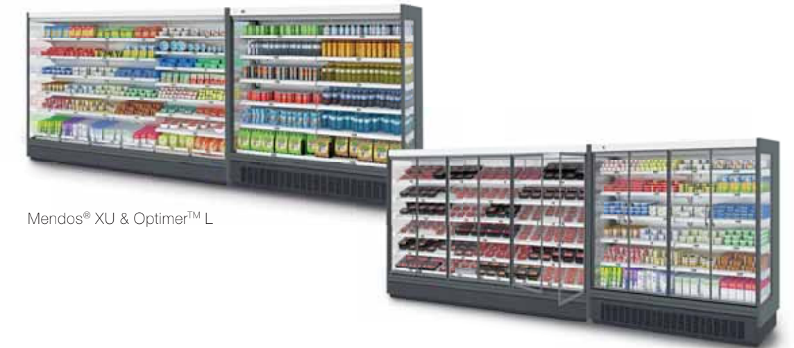
Mendos® XU & Optimer™ L

Limited retail space can require chillers and freezers to be placed side by side; the harmonized dimensions and uniform design of the small store program cabinets make this possible. The result is a more attractive store design without any loss of space. This flexibility applies to remote and plug-in cabinets as well as a combination of both.