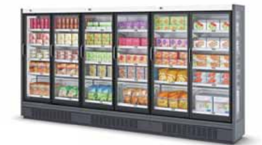
Velando™ CS – multiplexed

For shops with a high footfall and a limited sales area, flexibility in adjusting their sales assortment – sometimes seasonally – is a must in order to meet customer requirements. Existing remote installations (chillers and freezers) can be flexibly extended with a plug-in cabinet without touching the remote refrigeration system. All remote cabinets can be supplemented by any plug-in display case in matching dimensions and design. Additions or changes to the sales assortment can be realized easily.