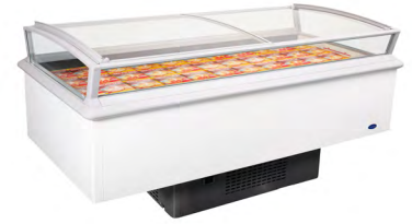
Multinor 2060/80 G