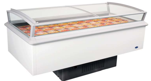
Multinor 2030 G