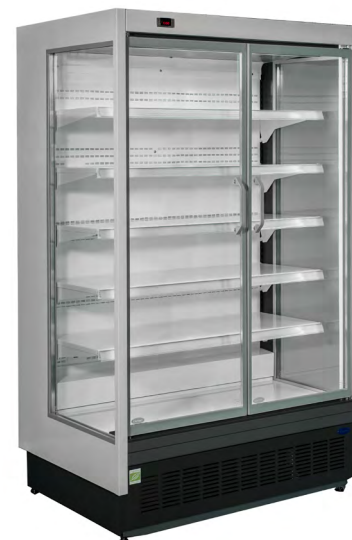
Optimer 1348 LG