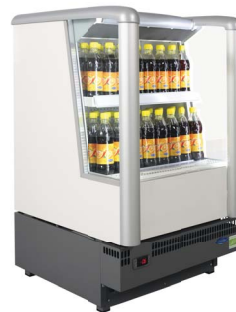
Presenter 0647 S