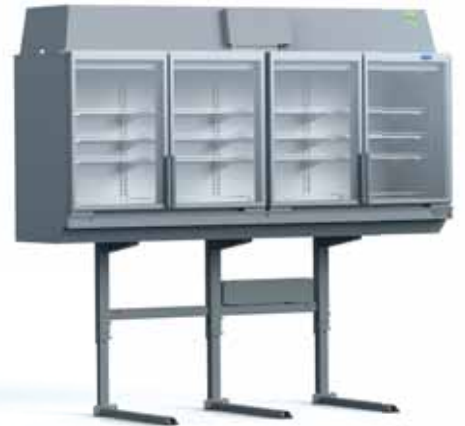
Top Freezer 2580 G