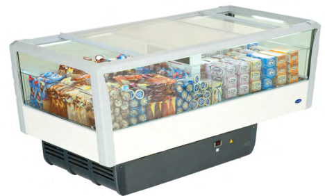
Premor 2060/80 G