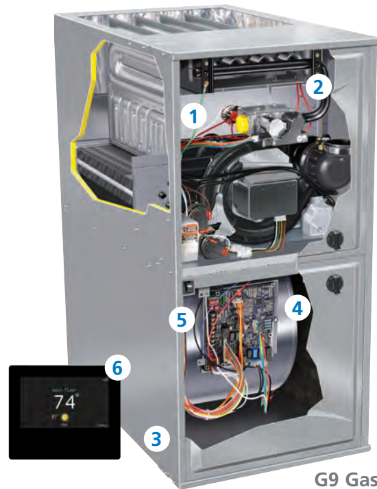
G9 Gas Furnace

Heil gas furnaces are designed for durability and comfort. The warmth and efficiency of natural gas combined with a quiet, efficient blower motor delivers comfort throughout the cold seasons. The gas furnace can also be combined with an indoor evaporator coil and properly matched outdoor air conditioner or heat pump to provide cooling during the warm seasons.