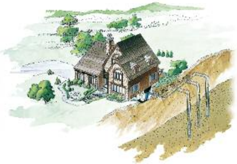
Vertical Loops: Used where land area is limited or soil conditions prohibit horizontal loops. Installed using a drilling rig.