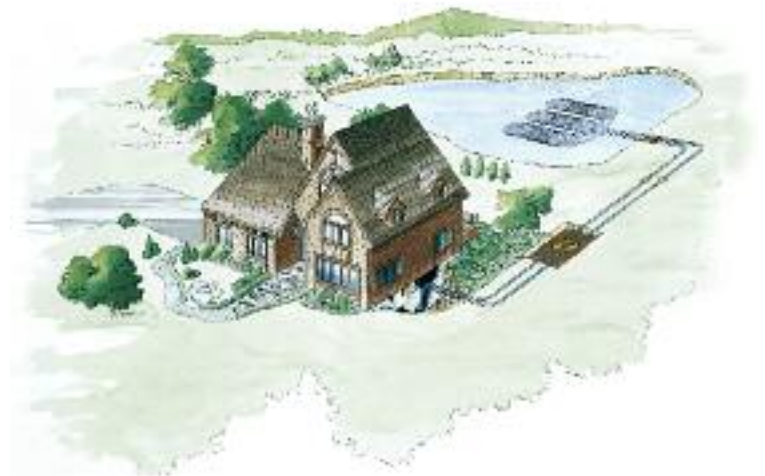
Pond Loops: Coils of pipe are fabricated and sunk to the bottom of the pond.