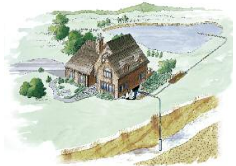
Open Loop: Well water from an existing well can be used, then discharged into a drainage ditch or pond.