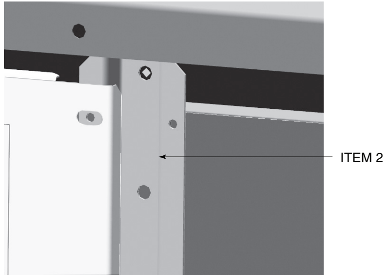
Fig. 1 — Close-up View of Center Channel Bracket (Item 2) for Security Grille/Hail Guard Installation