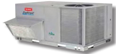
581J Preferred™ High Efficient 3 to 25 Ton Packaged Cooling with Gas Heat