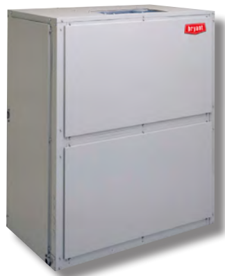
524J Legacy™ 6 to 20 Ton Air Conditioning and Heat Pump Split System Air Handler