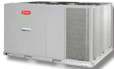
575J Legacy™ 6 to 20 Ton Single and Dual Circuit Split System Condensing Unit