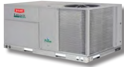
580J/582J Legacy™ Base Efficient 3 to 27.5 Ton Packaged Cooling with Gas Heat