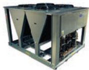
Gemini® Select 38AP Outdoor Condensing Unit