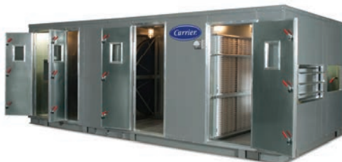
Carrier® Custom 39CC Air Handler