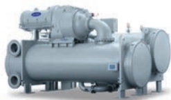
AquaEdge® 19XR Water-Cooled Chiller

Healthcare buildings can have the toughest requirements for air handlers, including consideration for recent sustainability initiatives and ASHRAE® Std. 170 guidelines, such as antimicrobial filtration, airborne contaminant control and energy recovery. Our Carrier® Custom 39CC Air Handler is designed with these requirements in mind. At Carrier, our experts work hard to create innovative products to help your most difficult projects come together seamlessly. We go above and beyond to deliver a single-system solution dedicated to clean air.